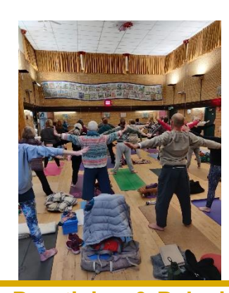
Practicing & Relaxing